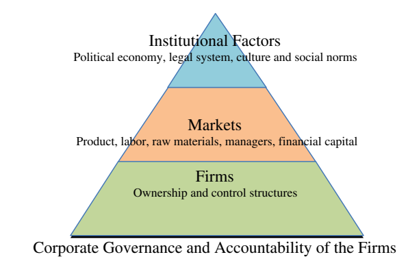
Figure 1.1: Layers of factors that shape corporate governance.

system is optimal to the institutional environment in which the firm is operating.