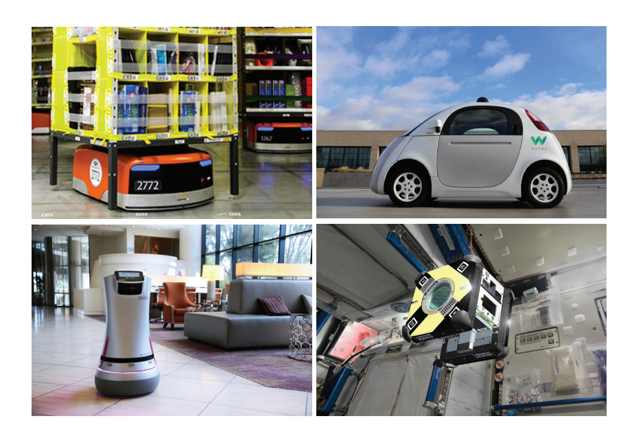
Figure 1.1: Non-humanoid robots, such as the Amazon warehouse robot, Waymo autonomous car, Savioke Relay, and NASA Astrobee (clockwise), are being regularly deployed and must use nonverbal signals to interact with co-located humans.

2013, Forlizzi and DiSalvo, 2006, Kittmann et al., 2015, Urmson et al., 2008, Wurman et al., 2008].