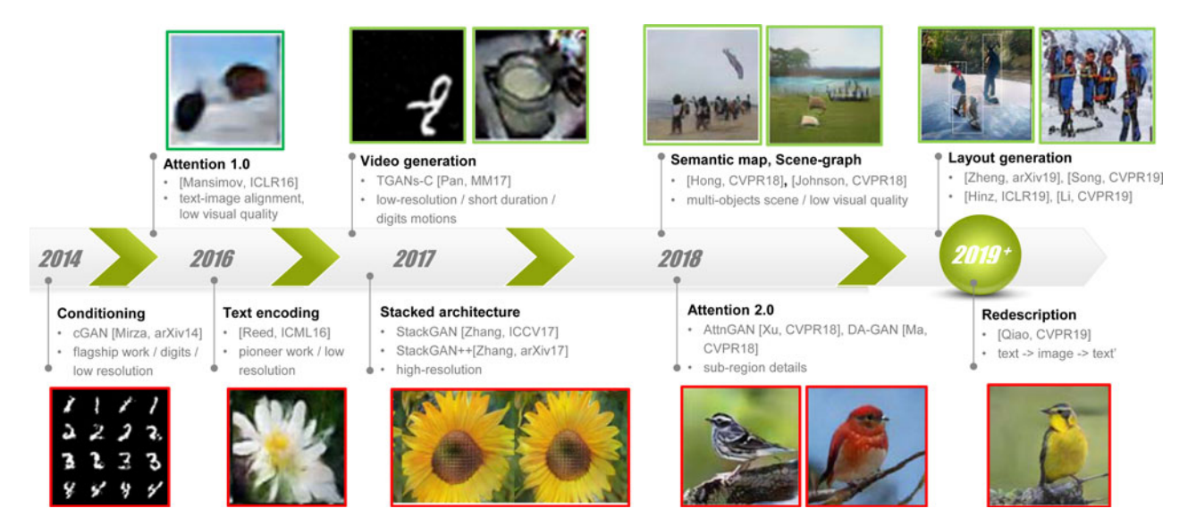
Fig. 3. The road map of "language-to-vision" in past five years, while milestone techniques are marked along the year axis. Top: single object generation. Bottom: multiple-objects scene generation.

The fundamental architecture is based on a conditional generative adversarial network, where the conditioning input is usually the encoded natural language. After a series of transposed-convolutions, the language input is gradually mapped to a visual image with higher and higher resolution. The key challenges are in two folds: (1) how to interpret the language input, i.e. language representation, and (2) how to align the visual and textual modalities, i.e. the semantic consistency between vision and language. Recent results on single object (bottom) have already been visually plausible to human perception. However, state-of-the-art models are still struggling in generating scenes with multiple objects interacting with each other.